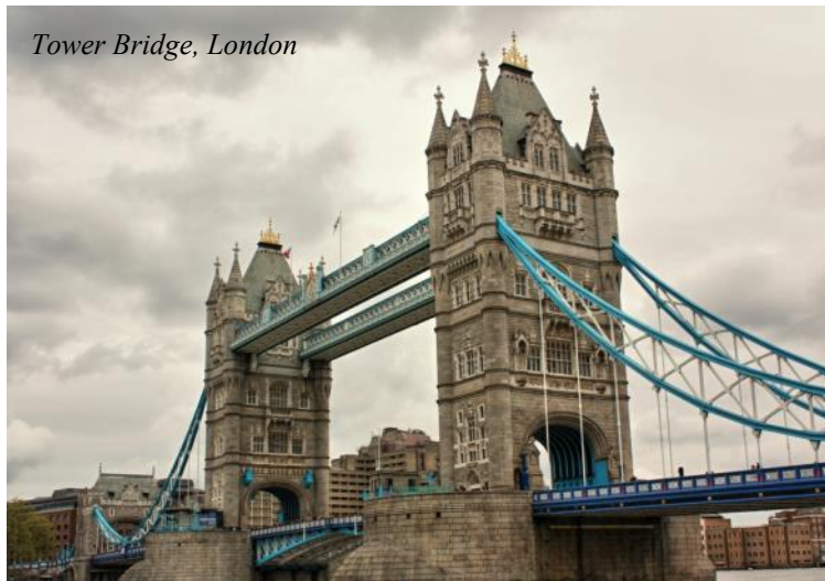
Tower Bridge, London

Dickens (and occasionally the late Virginia Woolf) have agreed to host our tour! It takes in not only the history of literature in London but some of its contemporary places and spaces too and looks at some key elements in our writers' lives. Starting in Fitzrovia, and ending in Soho, our tour also includes those pubs and bars associated with the British Film industry and contemporary writers. So, you never know who you might bump into! After the tour, we have dinner at a local pub. B, D