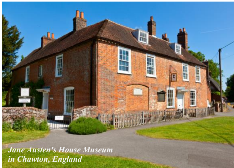
Jane Austen's House Museum in Chawton, England