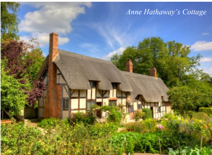
Anne Hathaway's Cottage