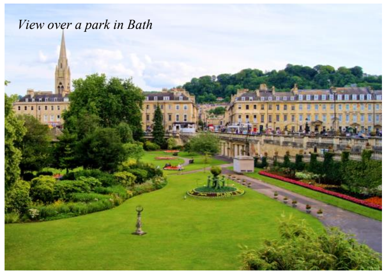
View over a park in Bath

We transfer to Stratford-Upon-Avon, where we explore the house where Shakespeare was born and grew up. We then travel down the road to Anne Hathaway's Cottage and gardens, where Shakespeare courted his bride-to-be. This rest of the day is free to pursue individual interests. B