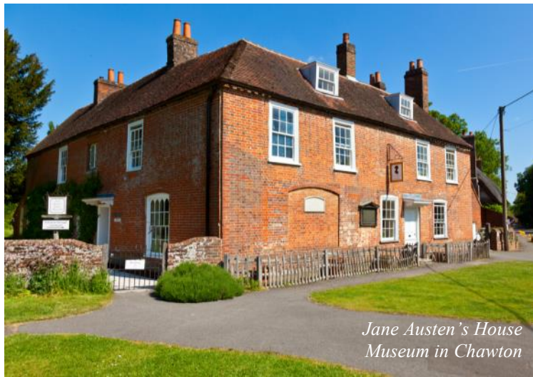
Jane Austen's House Museum in Chawton

the castle and the gardens. After our time at Highclere Castle* we travel to Winchester, our home for the night. The rest of the day is free to explore the Jane Austen sites Winchester, including her burial place at the Cathedral. B