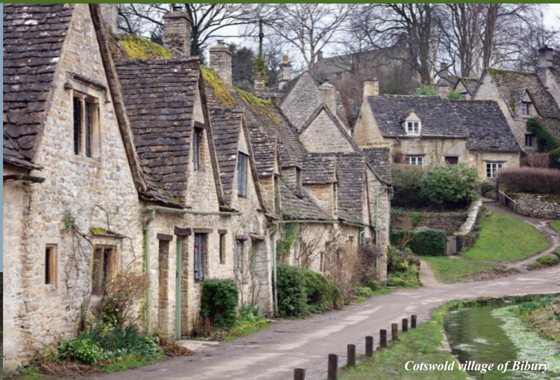
Cotswold village of Bibury

Register at the Library by calling (260) 824-1612 or online at wellscolibrary.org