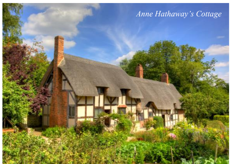
Anne Hathaway's Cottage

Today we leave the Devonshire area and head to Winchester. Our highlight today is Highclere Castle the site where Downton Abbey is filmed. We spend several hours touring