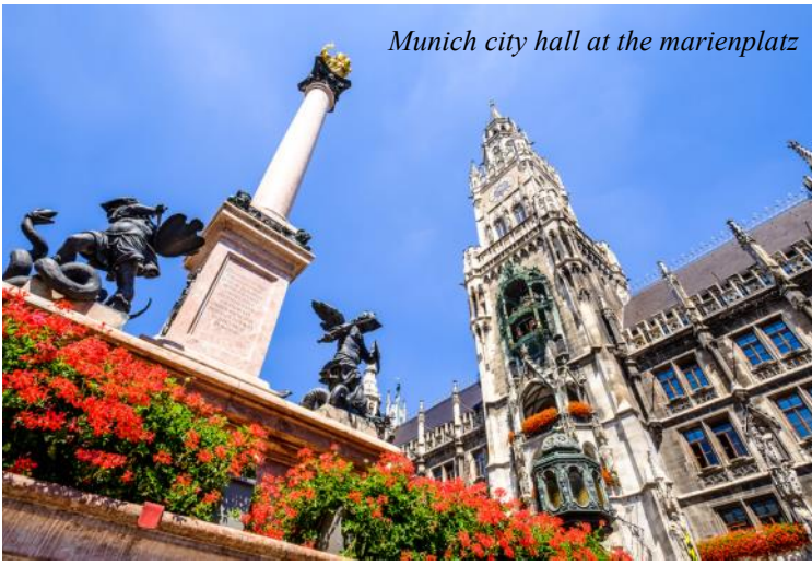
Munich city hall at the marienplatz