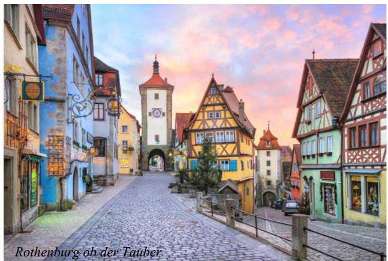
Rothenburg ob der Tauber

We start early today as there is much to see. We begin with a visit to Dornröschen Schloss Sababurg where Sleeping Beauty's Castle comes to life. Next, we stop at the fortress and town of Trendelburg, the stage of recited fairy tales and myths. Part of the mediaeval building complex is Rapunzel's Tower. Over the former drawbridge that leads across the moat leads, visitors must bend down to pass through the portal into the cobblestone fortress courtyard. From there, we see the window high up above, where Rapunzel let down her golden